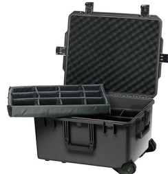
iM2750-X0002 With Padded Dividers