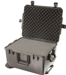
iM2750-X0001 With Foam