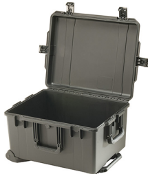
iM2750-X0000 No Foam