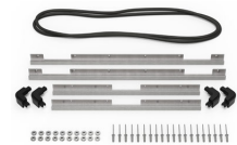
iM2720-M4-BEZEL-L Lid Bezel Kit (Metric)