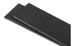
iM2200TPDIV Extra TrekPak Dividers