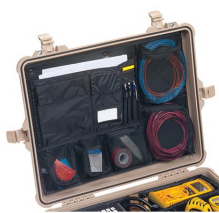
1609 Lid Organizer