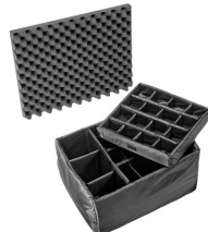
1625 Padded Divider Set