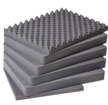
1621 6 pc. Replacement Foam Set