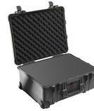
1560WF With Foam