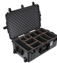
1595TP With TrekPak Divider System