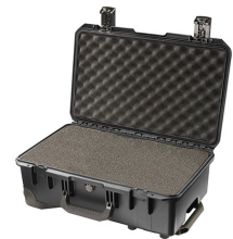
iM2500-X0001 With Foam