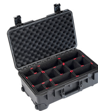
iM2500-X0006 With TrekPak Divider System