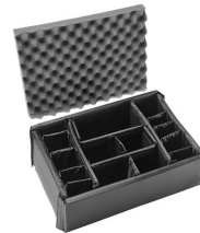
iM2370-DIV Padded Divider Set