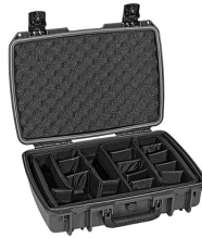
iM2370-X0002 With Padded Dividers