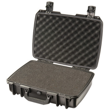
iM2370-X0001 With Foam