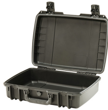
iM2370-X0000 No Foam