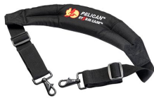
iM2370-STRAP-S Removal Padded Shoulder Strap