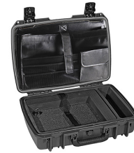
iM2370-X0003 Computer Case Deluxe