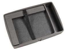
iM2370-COMPTRAY Computer Tray