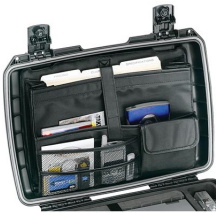
iM2370-UTILITYORG Utility Organizer