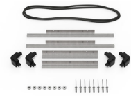
iM2200-M4-BEZEL-L Lid Bezel Kit (Metric)