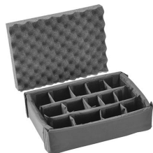
iM2200-DIV Padded Divider Set