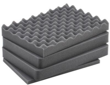
iM2200-FOAM 4 pc. Replacement Foam Set