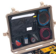
1609 Lid Organizer