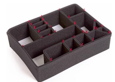
1600EUTP TrekPak Case Divider Kit