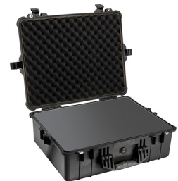
1600WF With Foam