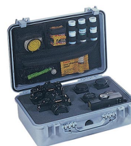
1508 Photographer's Lid Organizer