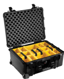
1564 With Padded Dividers