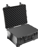
1560WF With Foam