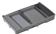
1499C Computer Bottom Insert