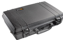
1490NF No Foam