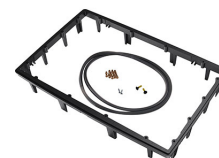
1490PF Special Application Panel Frame