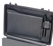
1498 Computer Lid Organizer