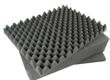
1491 3 pc. Replacement Foam Set