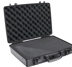
1490WF With Foam