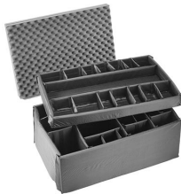
iM3075-DIV Padded Divider Set