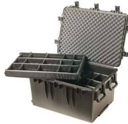
iM3075-X0002 With Padded Dividers