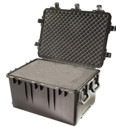
iM3075-X0001 With Foam