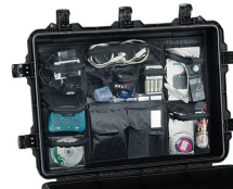
iM3075-UTILITYORG Utility Organizer