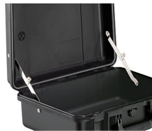
iM-LIDSTAY Lid Stay