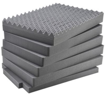
iM3075-FOAM 7 pc. Replacement Foam Set