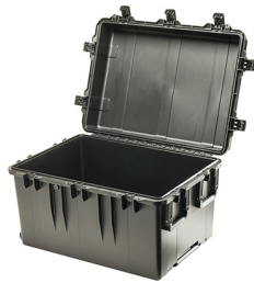
iM3075-X0000 No Foam