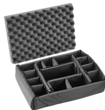
iM2300-DIV Padded Divider Set