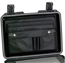
iM2300-LIDORG Lid Organizer