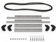
iM2300-M4-BEZEL-L Lid Bezel Kit (Metric)