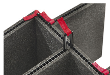
iM2300-TREK TrekPak Case Divider Kit