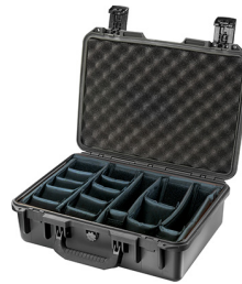
iM2300-X0002 With Padded Dividers