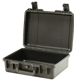
iM2300-X0000 No Foam