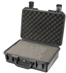
iM2300-X0001 With Foam