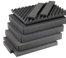
1607AirFS 7 pc. Replacement Foam Set