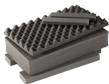
1535AirFS 3 pc. Replacement Foam Set