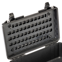
1535MP EZ-Click™ MOLLE Panel