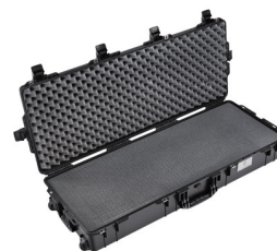
1745WF With Foam