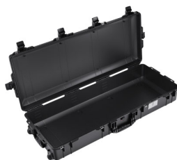
1745NF No Foam