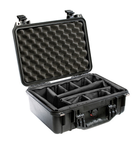
1454 With Padded Dividers