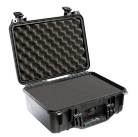
1450WF With Foam