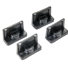
1507QM Quick Mounts - set of 4