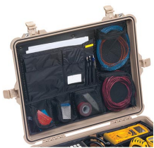
1609 Lid Organizer