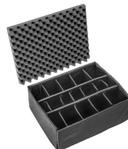
1615 Padded Divider Set