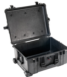
1610NF No Foam