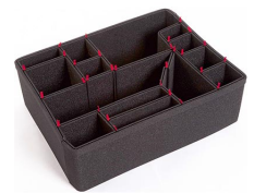
1610EUTP TrekPak Case Divider Kit