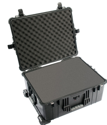
1610WF With Foam