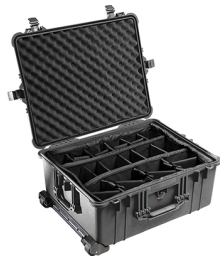
1614 With Padded Dividers