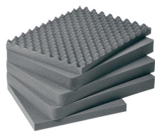
1611 5 pc. Replacement Foam Set