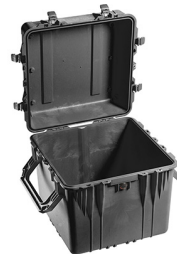
0350NF No Foam