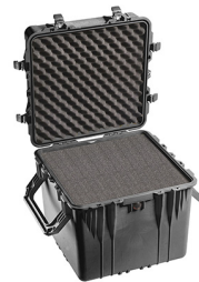
0350WF With Foam