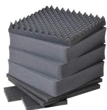
0351 7 pc. Replacement Foam Set