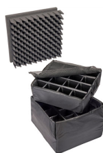
0355 Padded Divider Set