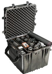
0354 With Padded Dividers