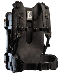
RucPac-Pro-1 RucPac Pro Hardcase Backpack Conversion