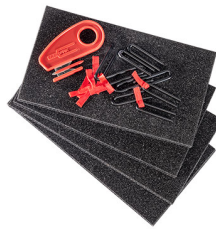
1506TPKIT TrekPak Case Divider Kit