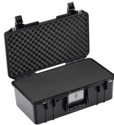
1506WF With Foam