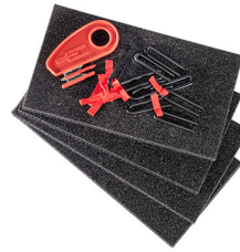
1506TPKIT TrekPak Case Divider Kit