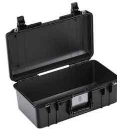
1506NF No Foam