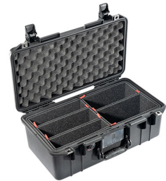
1506TP With TrekPak Divider System