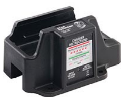
3770F Battery Charger Base