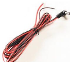
6061F Direct Wiring Rig for Fast Charger