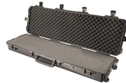
iM3300-X0001 With Foam