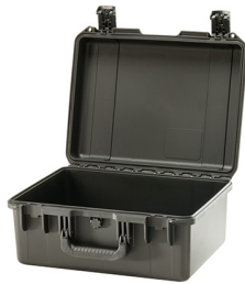
iM2450-X0000 No Foam