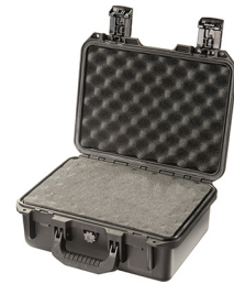
iM2100-X0001 With Foam