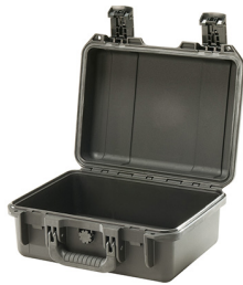
iM2100-X0000 No Foam