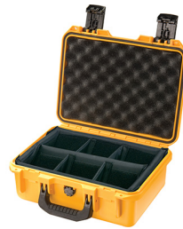
iM2100-X0002 With Padded Dividers