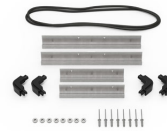
iM2100-MBEZ-B Base Bezel Kit (Metric)