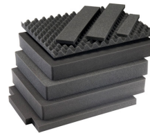
1637AirFS 8 pc. Replacement Foam Set