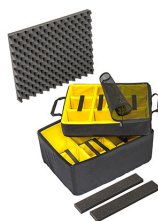
1607AirDS Padded Divider Set