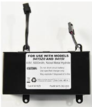
941820 Replacement Battery