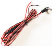
6061F Direct Wiring Rig for Fast Charger