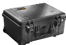
1560NF No Foam