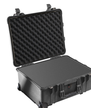
1560WF With Foam