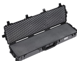
1755WF With Foam