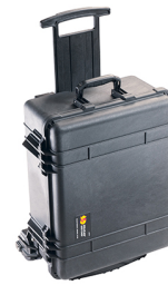
1560MWF With Foam