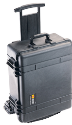
1560MNF No Foam