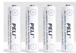
2469P Replacement Battery