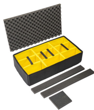
1615AirDS Padded Divider Set