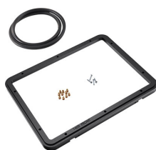
1400PF Special Application Panel Frame