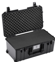
1556WF With Foam