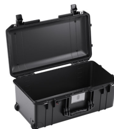
1556NF No Foam