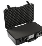
1525WF With Foam