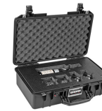
WHISKEY-1B Single Bottle Whiskey