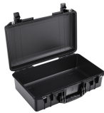
1525NF No Foam