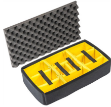
1525AirDS Padded Divider Set