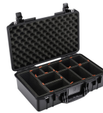
1525TP With TrekPak Divider System