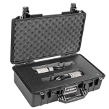
WHISKEY-2B 2 Bottle Whiskey