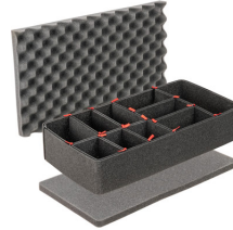
1525TPKIT TrekPak Case Divider Kit