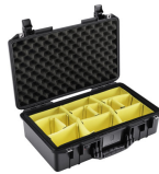
1525WD With Padded Dividers