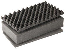
1525AirFS 3 pc. Replacement Foam Set