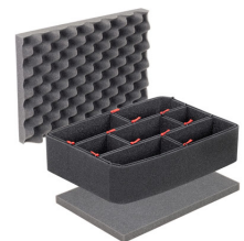
1450TPKIT TrekPak Case Divider Kit