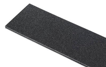
1450TPDIV Extra TrekPak Dividers