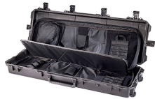
472-PWC-DW3200-BLK-BLK Black Case With Black Soft Case