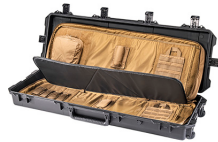
472-PWC-DW3200-BLK-COY Black Case With Coyote Soft Case