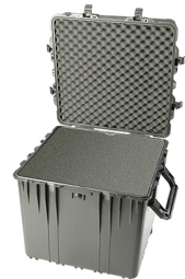
0370WF With Foam