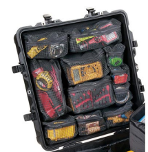
0379 Lid Organizer