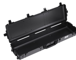
1755NF No Foam