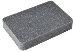
1052 Pick N Pluck™ Foam Insert