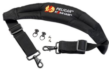
iM-STRAP-S-VER2 Padded Shoulder Strap