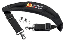
iM-STRAP-S-VER2 Padded Shoulder Strap