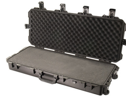
iM3100-X0001 With Foam