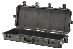
iM3100-X0000 No Foam