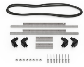
iM2306-M4-BEZEL-L Lid Bezel Kit (Metric)