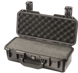
iM2306-X0001 With Foam