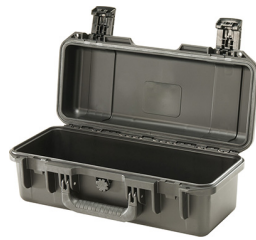
iM2306-X0000 No Foam