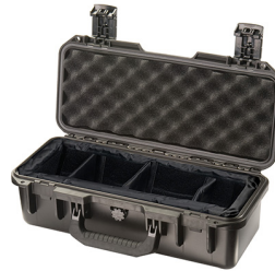
iM2306-X0002 With Padded Dividers