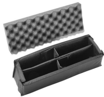
iM2306-DIV Padded Divider Set