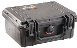
1150NF No Foam