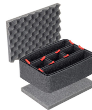
1150TPKIT TrekPak Case Divider Kit