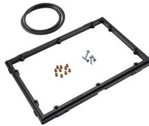
1150PF Special Application Panel Frame