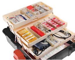
1466 Tray System for 1460EMS