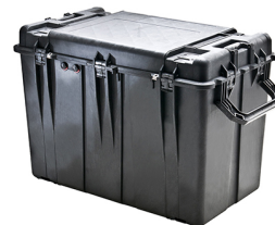
0500WF With Foam