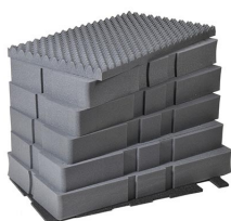
0501 7 pc. Replacement Foam Set