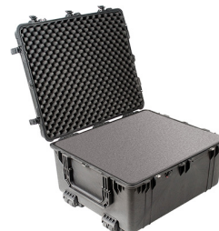
1690WF With Foam