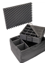
1665 Padded Divider Set