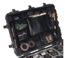
1669 Photo/Lid Organizer