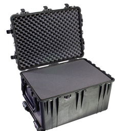
1660WF With Foam