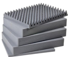
1661 5 pc. Replacement Foam Set

Wheels 4 Extendable Handle yes Master Pack 1 Nameplate yes Reduced Area yes Military yes