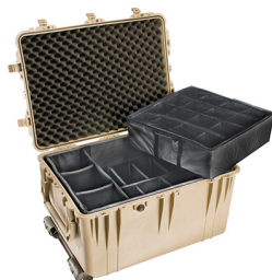
1664 With Padded Dividers