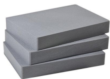
1662 Pick N Pluck™ Sections Only (set of 3)