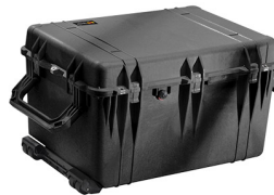
1660NF No Foam